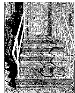
New steps were installed on a home in Pahrump using funds from the Homeowner Rehabilitation Program.